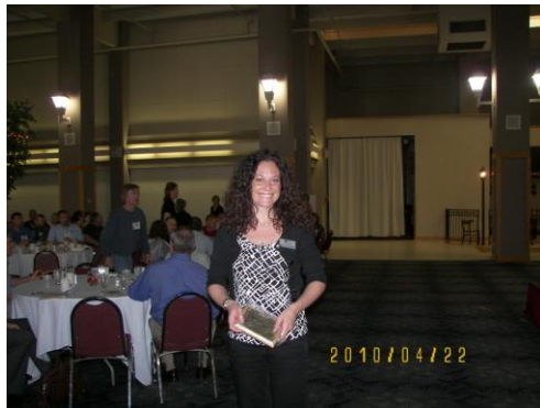
FIRST ADVANTAGE SAFERENT

Canterbury Enterprises Jet Laundry Mellotte, Morse, Leonotti, Parker Naeir Wind, Water, Energy Conservation