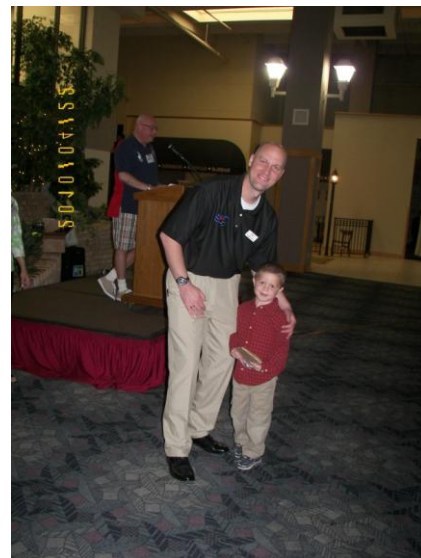
SAFEWAY SAFETY STEP