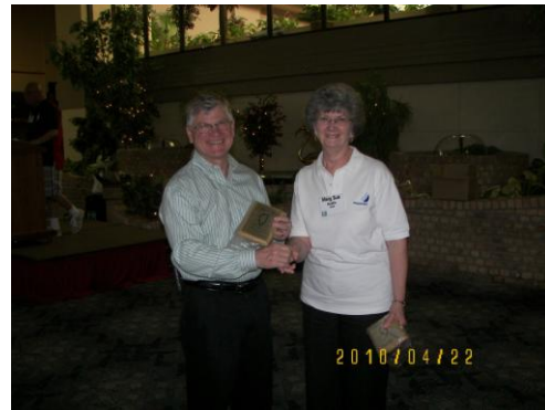
NAIR & MORRISSEY CONSTRUCITON