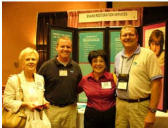
EVANS RESTORATION SERVICE